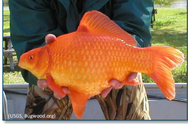
Goldfish can grow to many times their original size

Goldfish can introduce foreign diseases to waterbodies such as Koi herpesvirus (this virus does not affect humans)